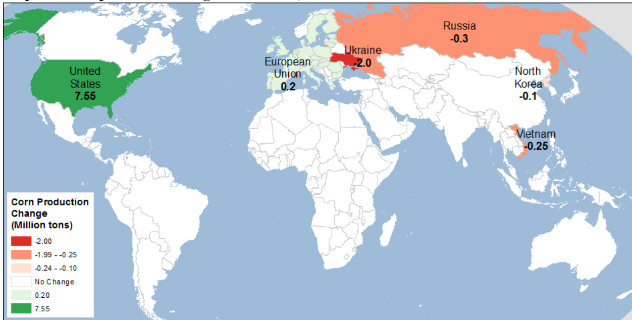
Map A – Corn production changes for 2017/18, November 2017