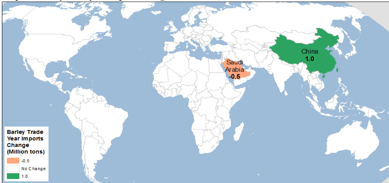
Map C – Barley trade year imports changes for 2017/18, November 2017